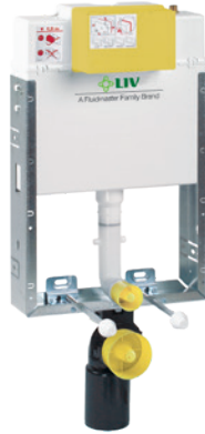
LIV-MOUNT WC 9012 (Art. No. 195850)